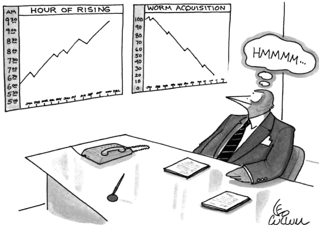
© The New Yorker Collection 1994 Leo Cullum from cartoonbank.com. All Rights Reserved..